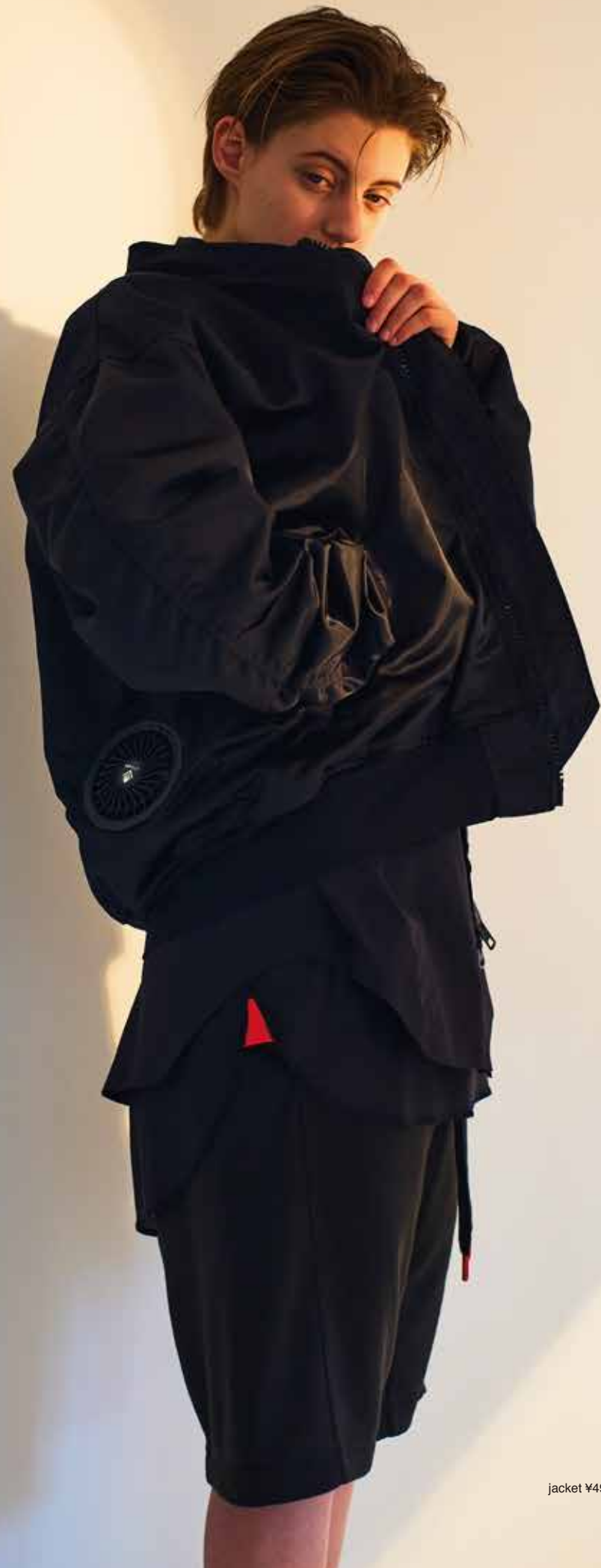
jacket ¥49,500 shirt ¥28,600 pants ¥19,800